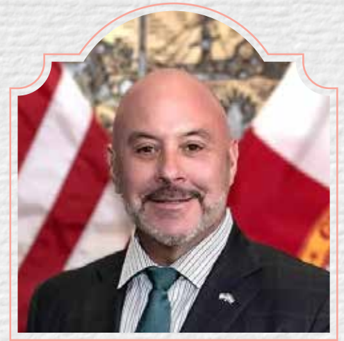
Blaise Ingoglia Florida Chief Financial Officer